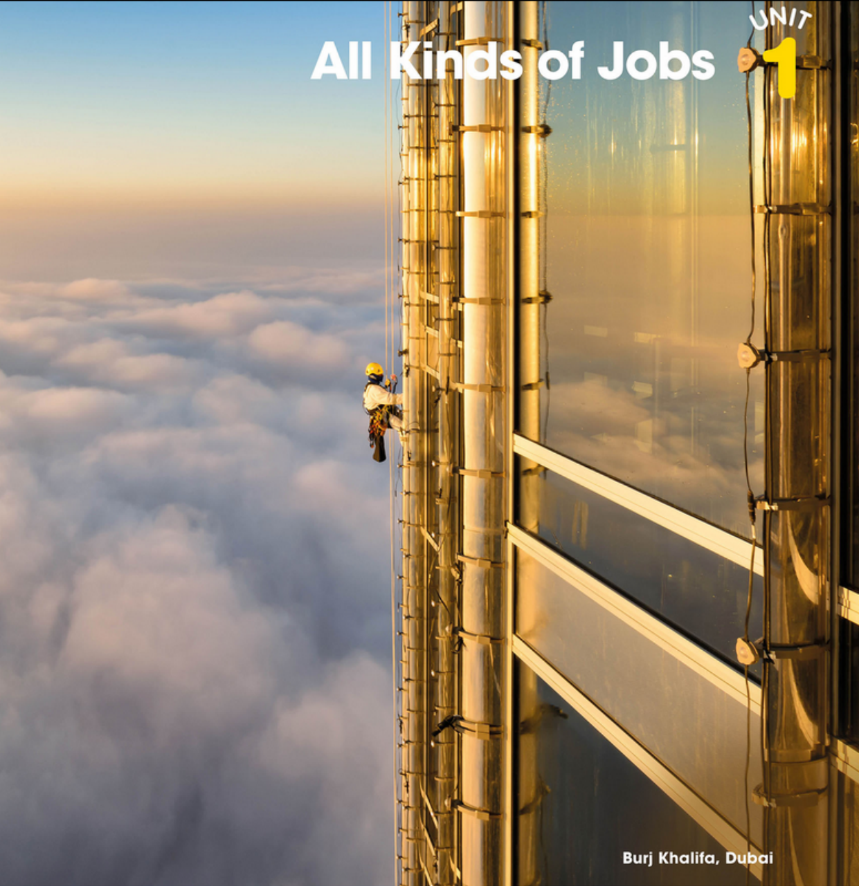
Burj Khalifa, Dubai

Look at the photo. Answer the questions.