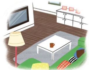
a living room