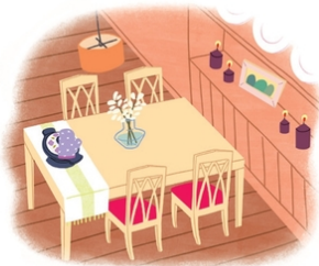
a dining room